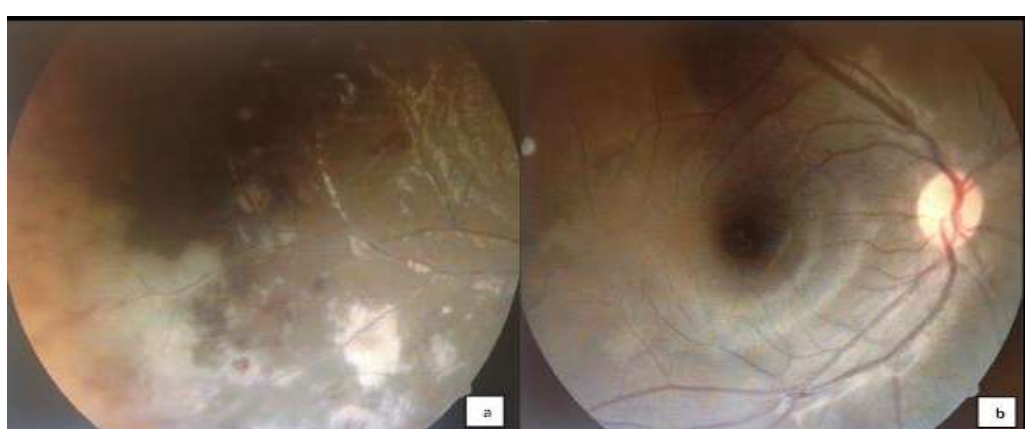
Figure 1: peripheral confluent retinal infiltrates with areas of retinal haemorrhage (a); posterior pole appearing normal (b)