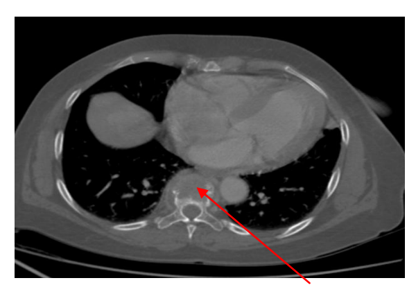
Figure 1: destructive spinal lytic lesion (red arrow)

The diagnosis of hepatocellular carcinoma complicated by spinal metastasis was made, and the patient started on analgesic treatment, which made it possible to obtain a partial regression of the pain. The patient was released on symptomatic treatment before being readmitted one month later and died of hepatic encephalopathy.