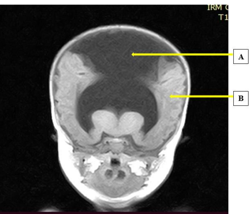
Figure 3: MRI scan of the encephalon in frontal section displaying a single dilated cavity giving the rest of the parenchyma a horseshoe appearance. A= Single dilated cavity, B= Remaining cerebral parenchyma.