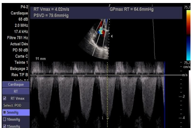
Figure 4: Continuous Doppler over the tricuspid valve showing pulmonary hypertension 79.6 mmHg.