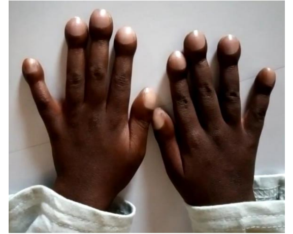
Figure 2: Severe digital hippocratism in a 5 year old boy with tetralogy of Fallot.

Associated lesions were PDA and ASD in 4.8% (5/105) and 3.8% (4/105) of the patients, respectively. Genetic syndromes were found in 15% of the cases. Both cyanosis and dyspnea were reported in 76.2% (80/105) of the patients; only 7.6% (8/105) and 16.2% (17/105) of the children had isolated cyanosis or dyspnea, respectively. Eleven (10.5%) patients presented with severe digital hippocratism, as shown in Figure 2.